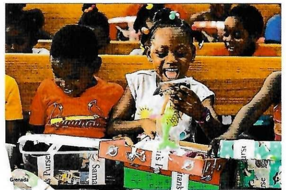
Operation Christmas Child Shoebox Recipients