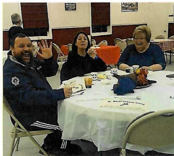
Happy Customers at our Spaghetti Dinner

Please help us fill St. Mark's bucket with your pocket change for our basement repair