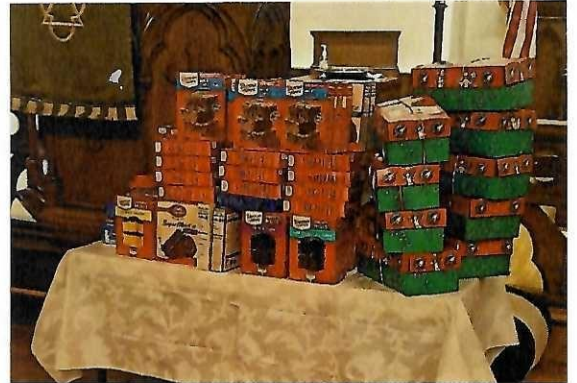
Joshua Project Cake Mixes and Operation Christmas Child Shoeboxes